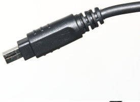
Kabel N6. Nikon D70s/D80