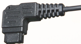
Kabel S6. Sony A33/A35/A55/A65/A77/A100/A200/A300/A350/A450/A500/A700/A850/A900, Minolta Dynax 7D/5D/Dynax 9, 7,5, 4, 3 Dynax 807si, 800si, 700si, 600si, 505si