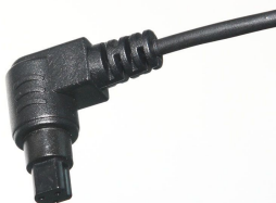
Kabel C8. Canon EOS 1V/3/1D/1Ds/1DS Mark II/1Ds Mark III/1D Mark II/1Ds Mark III 10D/20D/30D/40D/50D/5D/5DMkII/6D/7D/5DMkIII/5DS/5DSR