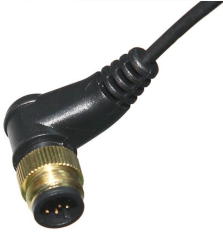
Kabel N8. Nikon N90s/F5/F6/F100/F90/F90X/D1/D1H/D1X/D2/D3/D2H/D2Hs/D2X/D2Xs D200/D300/D700/D800/D810 Kodak DSC-14N/Fuji S3 Pro/Fuji S5 Pro