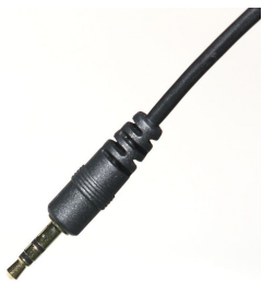
Kabel C6. Canon EOS 30/33/50/60D/70D/80D/100D/300/300D(Digital Rebel)/350D(Rebel XT)/400D(Rebel XTi)/450D(Rebel XSi)/500D/550D/1000D(Rebel XS)/600D/650D/ 700D/750D/760D/ 1100D/1300D/3000N/5000/1200D/EOS RP Samsung GX-1S/GX-1L/GX-10/GX-20 Pentax K1/K110D/K100D/K200D